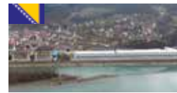
Goražde (Plant 2), Bosnia and Herzegovina