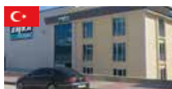
Çerkesli-Dilovşı (Istanbul), Turkey