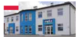
Bedzin (Katowice), Poland