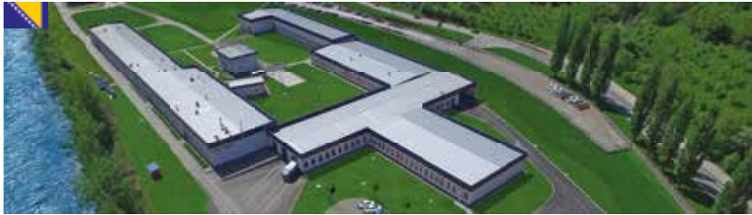
Goražde (Plant 1), Bosnia-Herzegovina