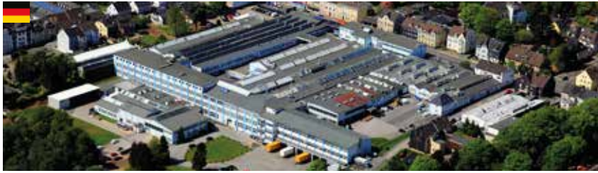
Company headquarters Velbert, Germany